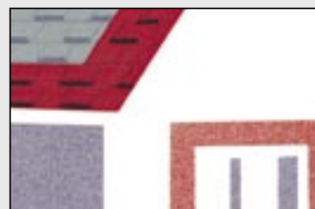
Applying a layer of Moisture Guard Plus to the deck at all rake and eave edges a minimum of 24" beyond the interior wall line will provide a last line of defense against leaks, to help prevent backed-up water from getting into the home.