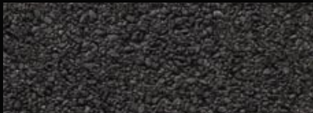
RUSTIC BLACK ●◆

Elite Glass-Seal® AR available in colors marked with a ● Glass-Seal available in colors marked with a ◆