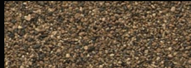
RUSTIC CEDAR ●◆