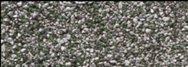
PASTEL GREEN ●