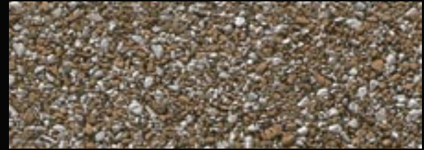
PASTEL BROWN ●