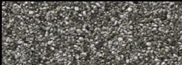
GREY BLEND ●