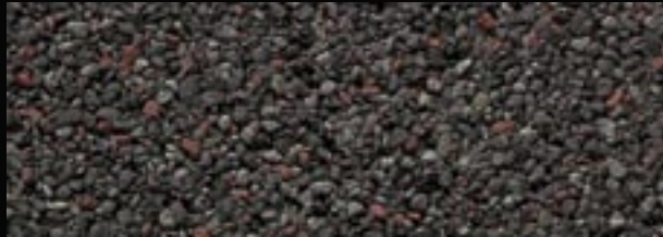
SLATETONE GREY ●