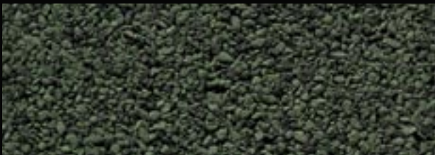
EMPIRE GREEN BLEND ●