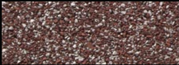
PASTEL RED ●