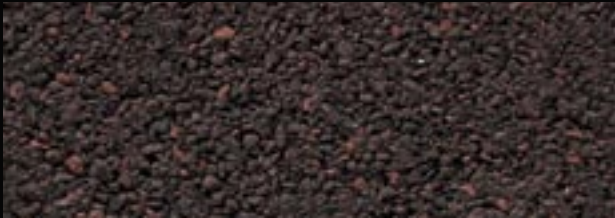
RUSTIC REDWOOD ●