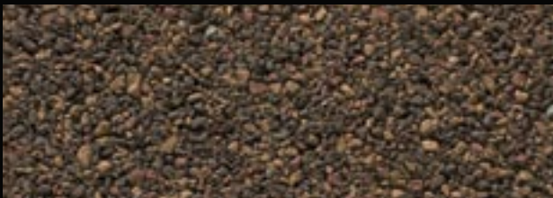
TWEED BLEND ●◆