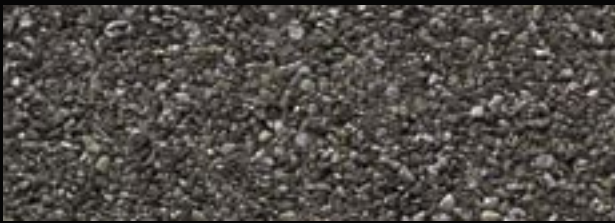
ANTIQUE SLATE ●◆