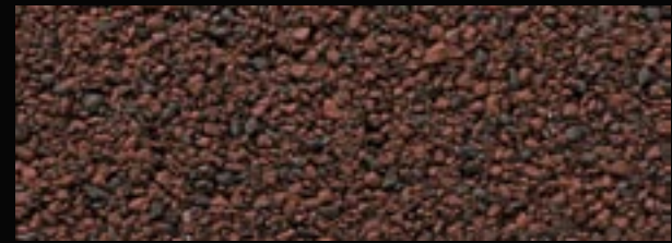
TILE RED BLEND ●