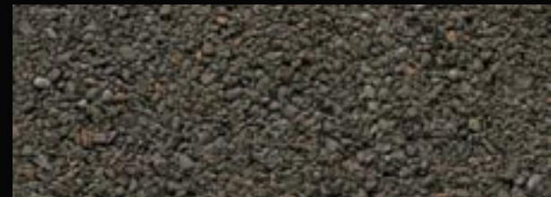
WEATHERED WOOD ●◆